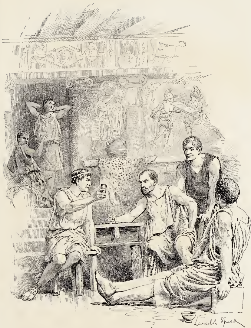
"Some of the gladiators were playing at dice."